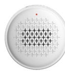
AVM-DB2-CHM1 Doorbell Chime